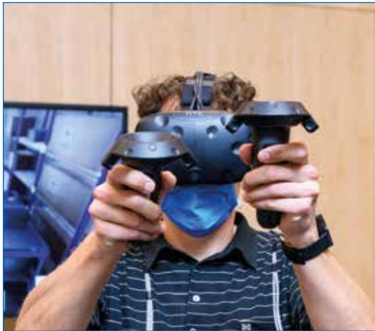
Virtual Reality ermöglicht das Eintauchen in virtuelle Arbeitswelten, © Gregor Nesvadba

These data can be used for software-supported evaluations of whether and how the forklift operator is distracted during his work, whether he can perceive all dangerous situations and how he or she reacts in different situations. This forms the basis for the analysis of actual situations and for the development of measures that contribute to the improvement of safety in intra-company transport.