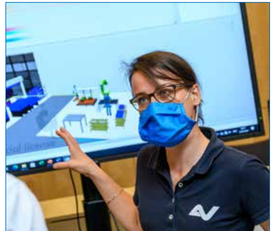
In the AUVA prevention department, digital prevention has long been a reality.

The aim of the developments with regard to quality in work is to ensure that no longer man has to adapt to technology, but that it is the technology that is increasingly oriented towards people: Sensors on the operator's body (wearable sensors) record various parameters and can, for example, detect stress. With the help of cloud solutions, machine learning and visual analytics, it should be possible to process and evaluate the data in such a way that, for example, as the immediate consequence is that the robot adapts its "working speed", thus reducing the stress level of its collaborating human counterpart.