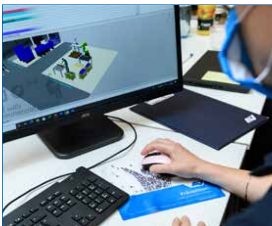
One focus of digital prevention is on a wide range of simulations, here the example of ema (editor human work).