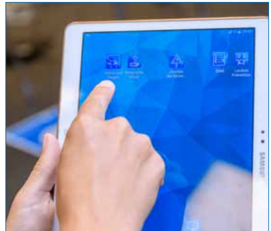
Already proven for several years: The Apps of the AUVA.

Simulation possibilities are also available today in the field of room acoustics: rooms of all kinds (from the production hall to training rooms, from the office to the classroom) can be created today on the computer in 3D. With the help of the calculation software Odeon, the acoustic properties of surfaces or the sound absorption coefficient of objects are defined. If measurements have already been carried out in the corresponding rooms, these can also be incorporated. The software now allows, taking into account the applicable legal regulations, to not only calculate different variants of room acoustic measures, but also to be issued as “audio examples”, taking subjective criteria into account. This makes it much easier for