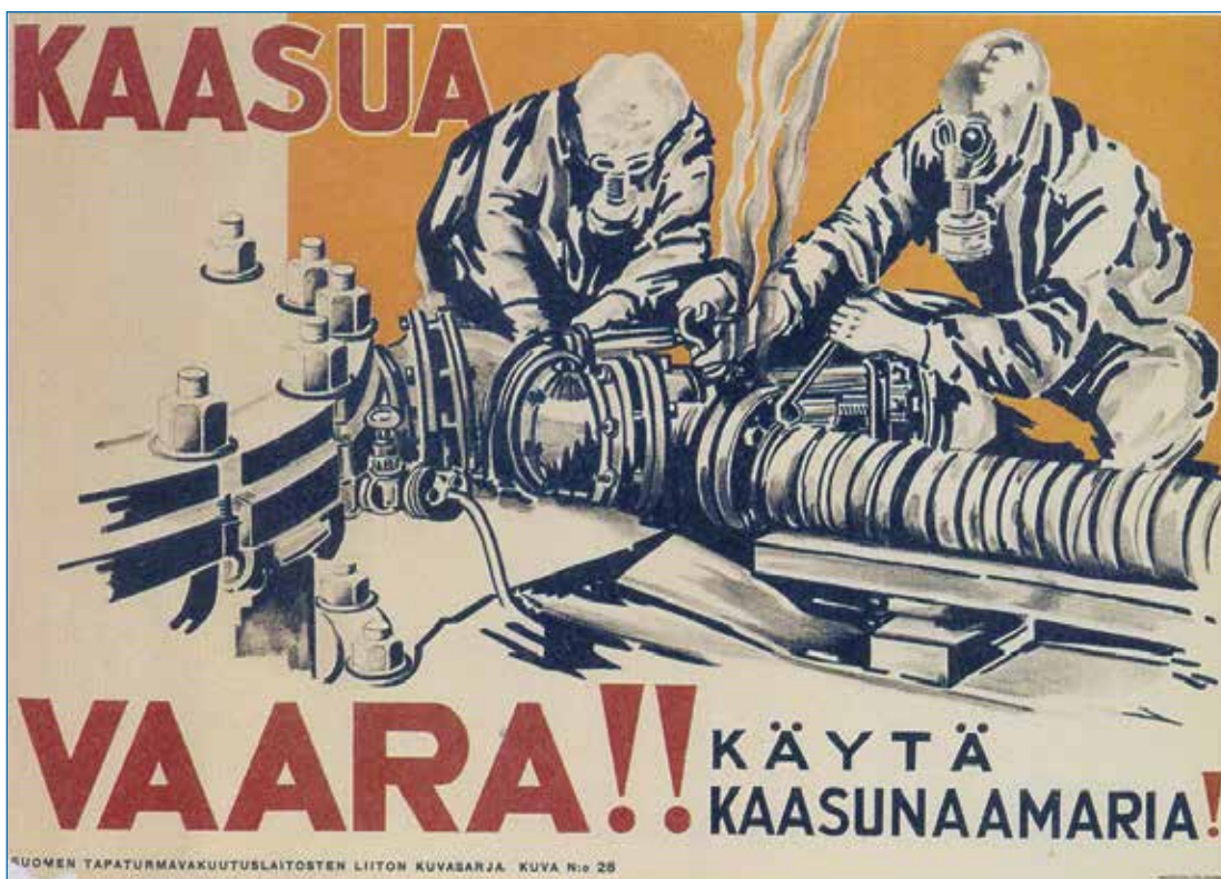
Gas! Dangerous! Use Gasmask!

Sanna Sinkkilä Finnish Workers' Compensation Center (TVK) www.tvk.fi