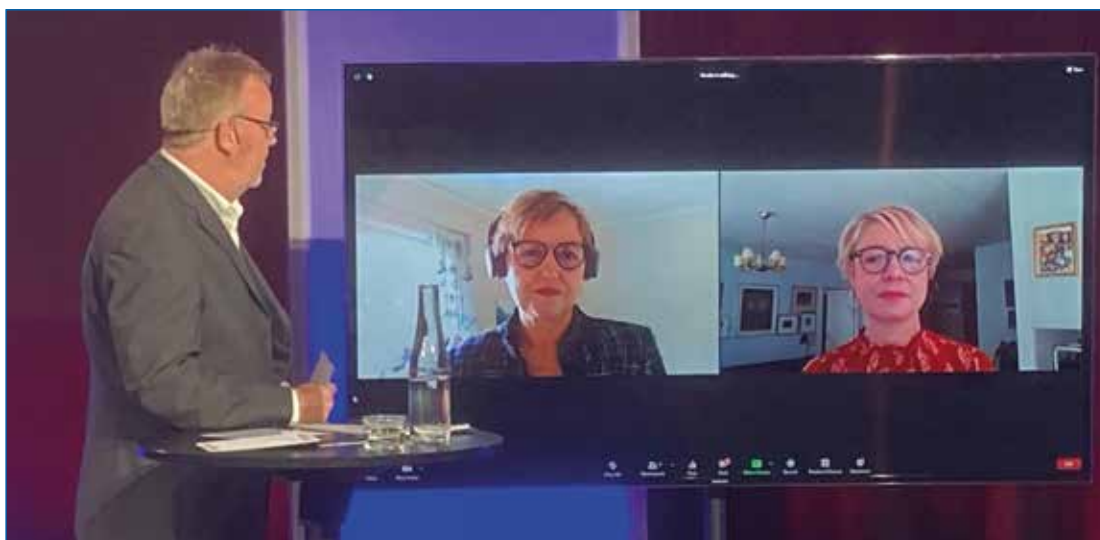
A seminar via web to some 500 participants, and 2 of the lecturers via link!

Shortly after the article for the previous Forum News was written, the government changed the legislation so that COVID-19 is now included in the list of infectious diseases that can be recognized as an occupational disease. But the same list also states that in order for the infection to be recognized as an occupational injury, the person must have contracted the infection: "during work at a health care facility, or in other work in the treatment or care of an infectious person, or in the handling of infectious animals or materials."